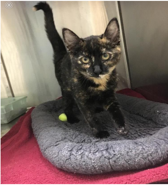
Lucia, female intact approximately 3 months old