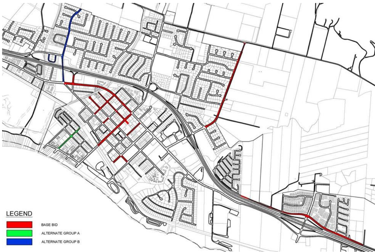
Proposed street segments to include in the 2017 Pavement Maintenance Project.

Public Works was authorized to move forward on a citywide pavement maintenance project utilizing $500,000 of the General Fund. Staff has worked with engineers at Pavement Engineering Inc. (PEI) to develop a list of proposed street segments to apply slurry seal treatment to and took it to City Council in November for approval. The Department has advertised this project for bid and anticipates work to begin in the fall.