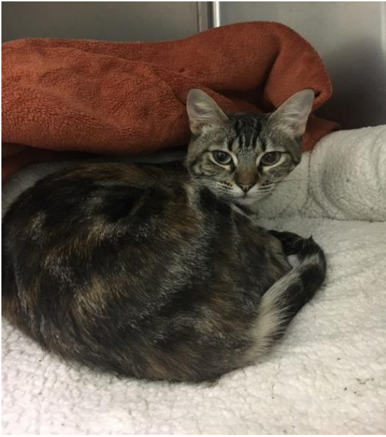
Tracee, female spayed approximately 1 year old.