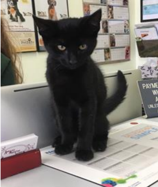
Ebonito, male intact approximately 3 months old.